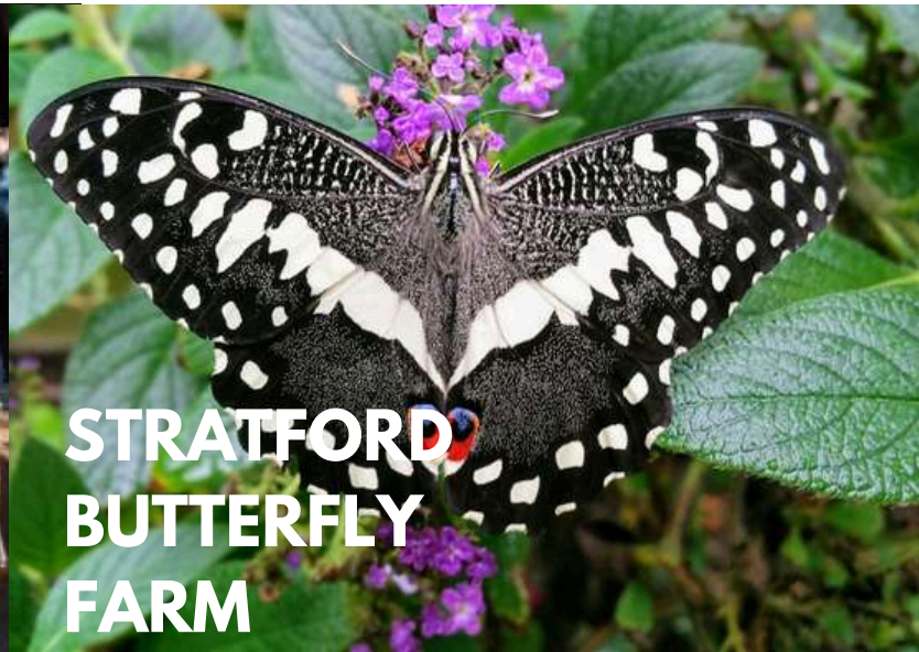
STRATFORD BUTTERFLY FARM