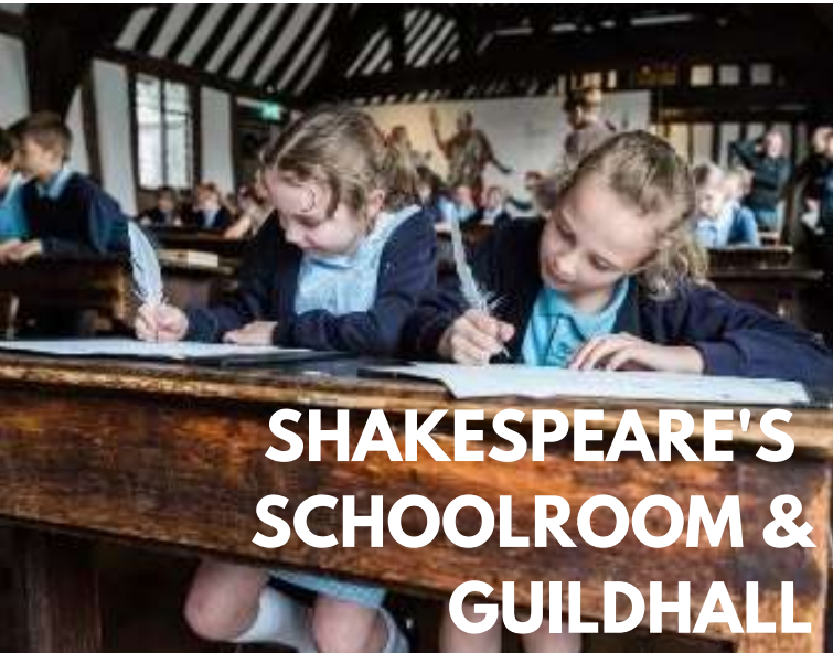
SHAKESPEARE'S SCHOOLROOM & GUILDHALL