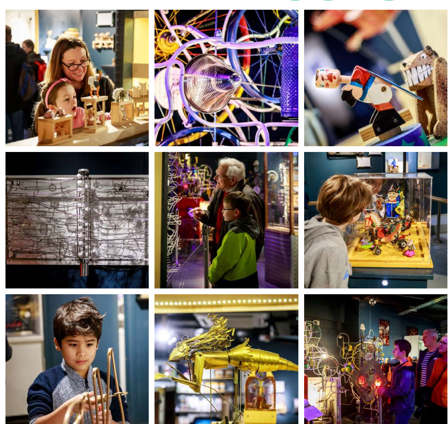
ART. DESIGN. PHYSICS. ENGINEERING. MATHS

MARVEL, INTERACT & EXPLORE AT THE UK'S ONLY MECHANICAL ART VENUE