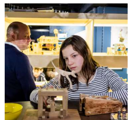
ART. DESIGN. PHYSICS. ENGINEERING. MATHS

MARVEL, INTERACT & EXPLORE AT THE UK'S ONLY MECHANICAL ART VENUE